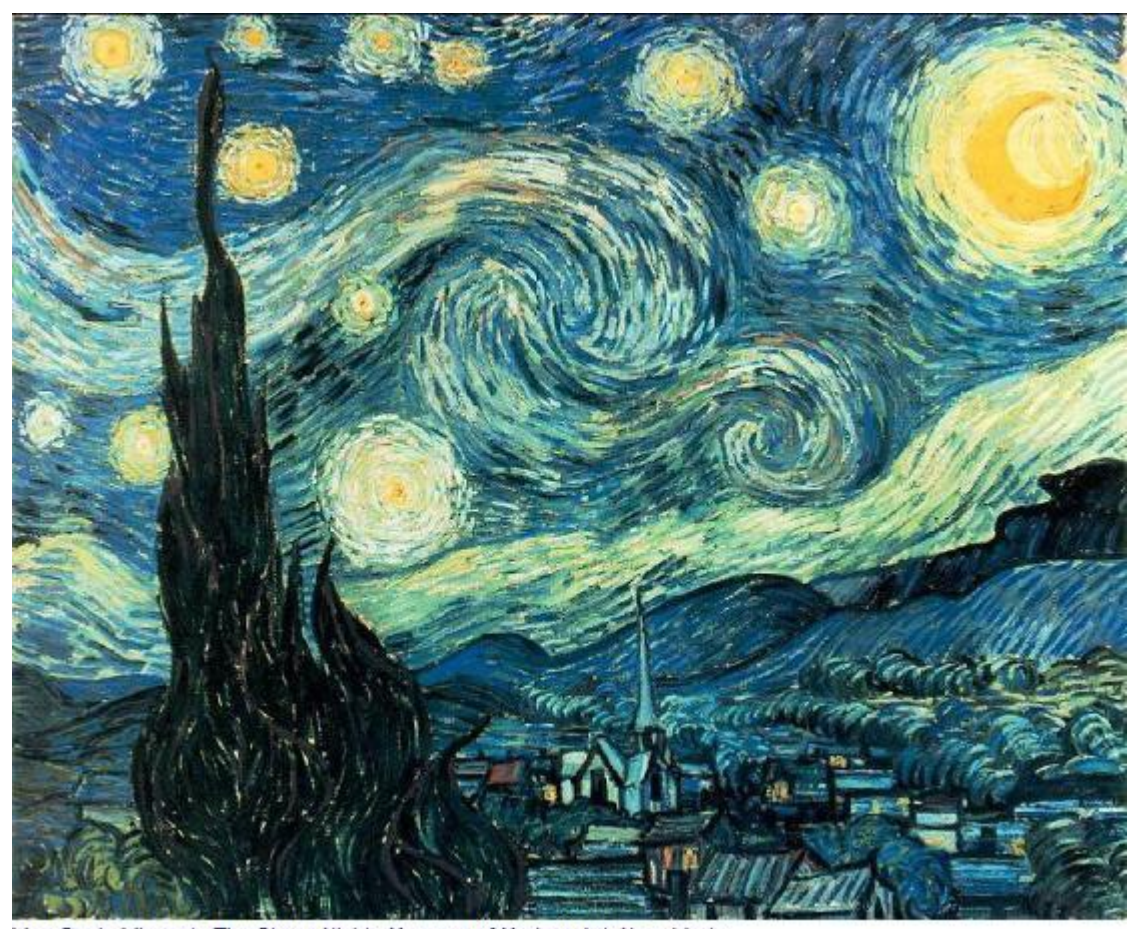
Van Gogh, Vincent. The Starry Night. Museum of Modern Art, New York.