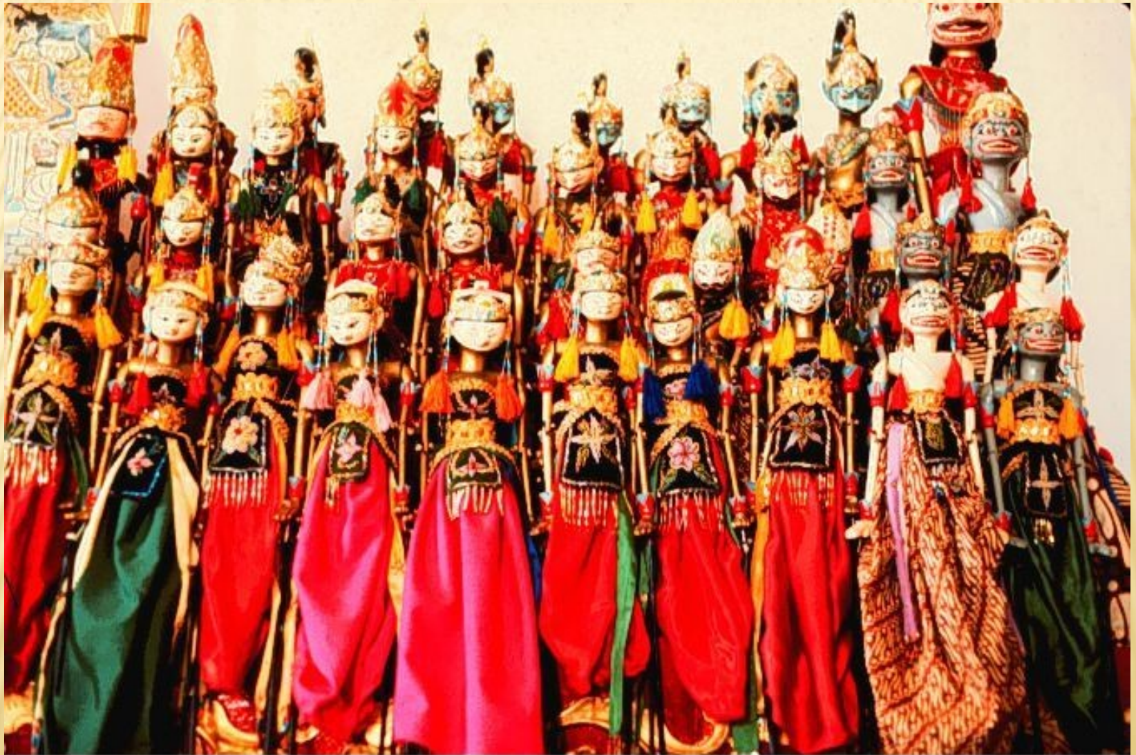
Wayang golek, wooden three dimensional puppets.