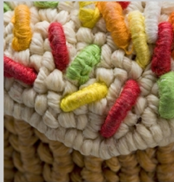
CUPCAKE WITH SPRINKLES waxed linen, cotton floss 4 x 4 x 4 inches