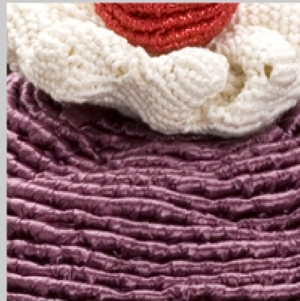
HF SUNDAE cotton and synthetic ribbons 12 x 6 x 6 inches