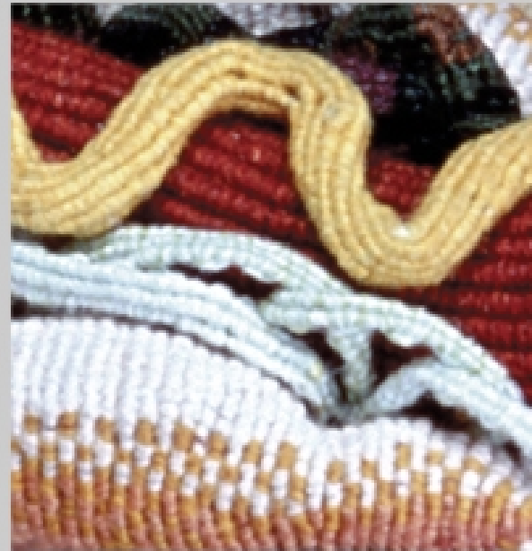
HOT DOG waxed linen, linen, cotton floss 3 x 7 x 3 inches