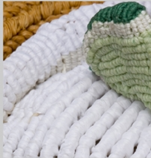
KEY LIME PIE waxed linen, raffia 4 x 4 x 5 inches