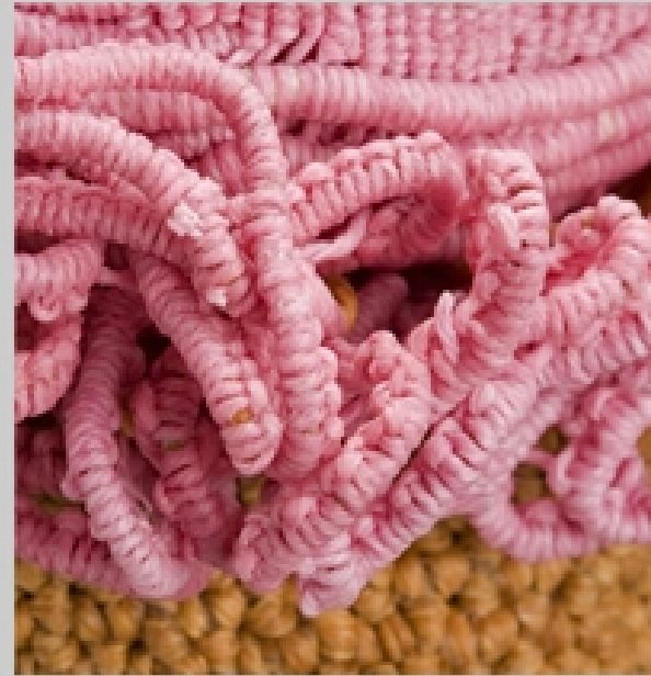
ICE CREAM CONE waxed linen, cotton floss, 6.5 x 6 x 6 inches