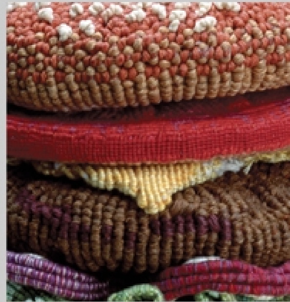
BURGER II waxed linen, linen cotton, polyester 5 x 5 x 5 inches