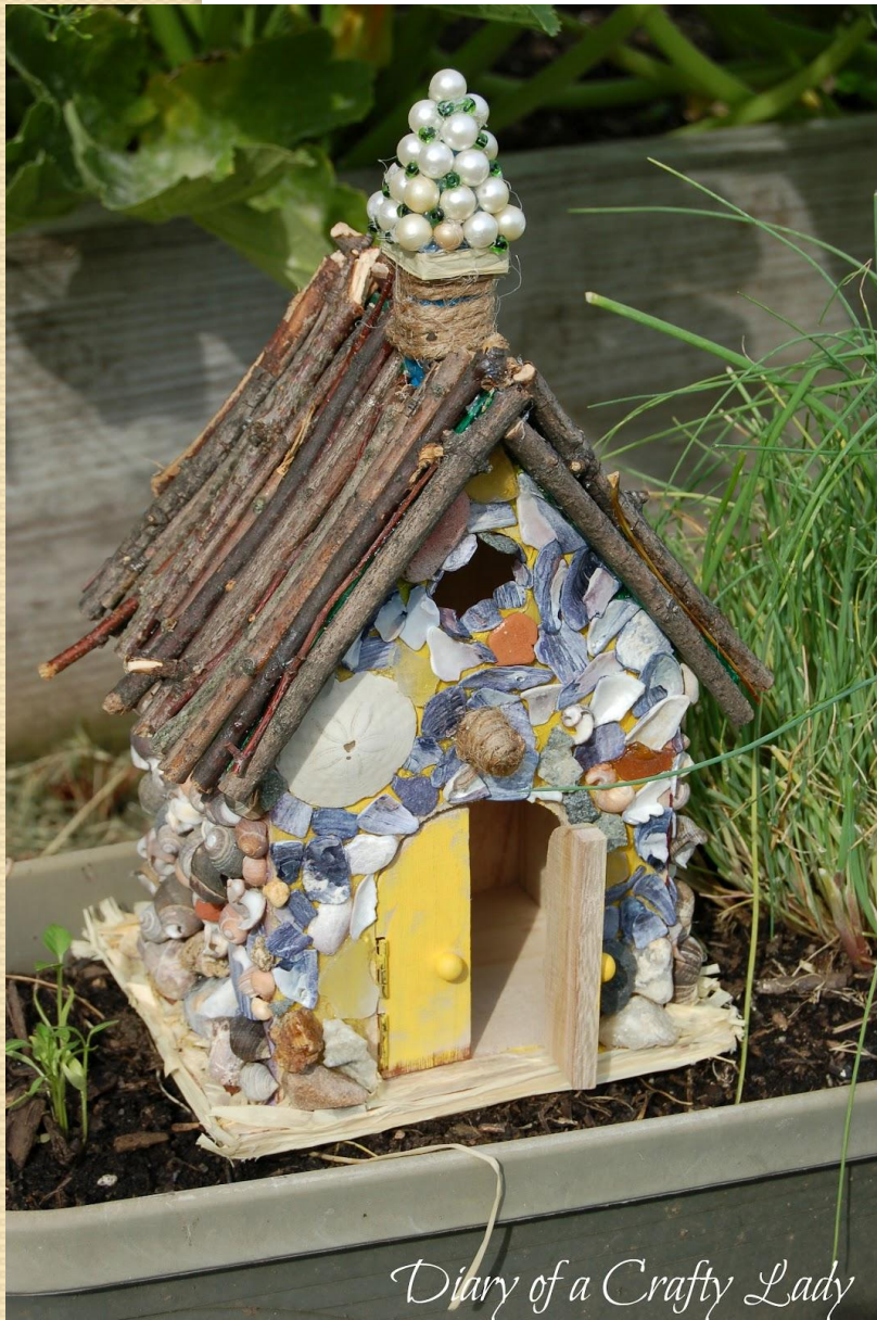
Diary of a Crafty Lady